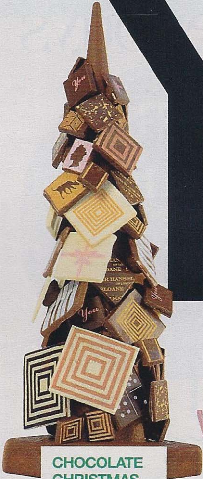
CHOCOLATE CHRISTMAS TREE , £24.50, Sir Hans Sloane

Scrumptious selections for those who have been really good this year