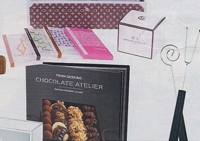
CHOCOLATE-MAKING KIT (includes tools, moulds and Chocolate Atelier book), £25, Chocolate by Trish, from Selfridges

(couture chocolates, pearls, salted caramels and truffles), £75, Artisan du Chocolat